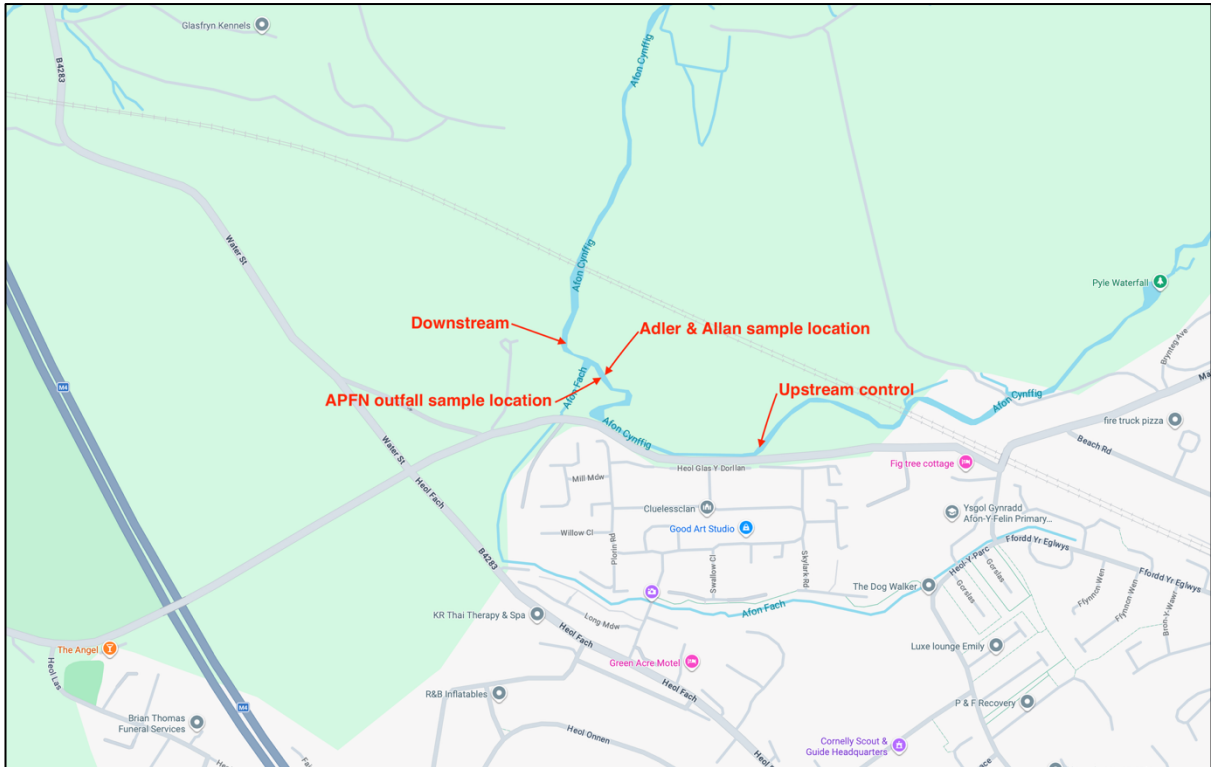
Figure 1: APFN sampling locations

The same monitoring locations identified and used during previous site visits were used. A further sample location was added (Adler & Allan sample location) for comparison of results.