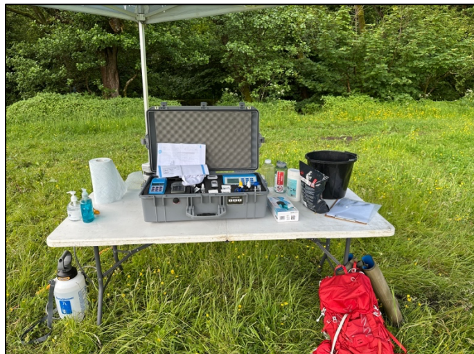
Figure 2: APFN field apparatus

It was noted that the access code for the locked compound had been changed since APFN's previous visit. This prevented access using the previously available code despite assurances provided during the meeting of 29 May 2026 that independent monitoring of the affected area would be supported.